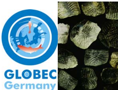
Figure: Globec Logo ( www.globec.org ); Sardine scales

October: 2nd Globec Open Science Meeting, invited lecture about GeoBio-Center LMU research in upwelling sediments of Namibia held by Uli Struck. Qingdao, P.R. China